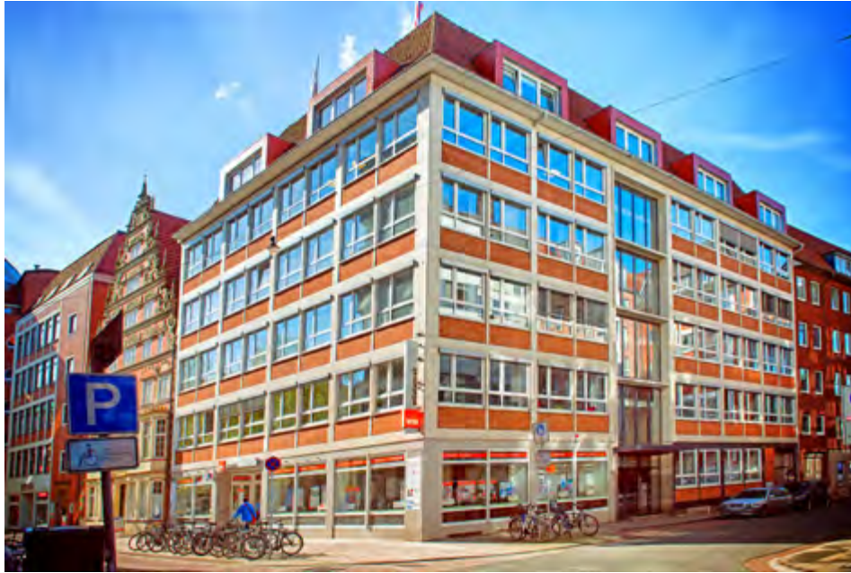
Achelis Headquarters, Bremen, Germany