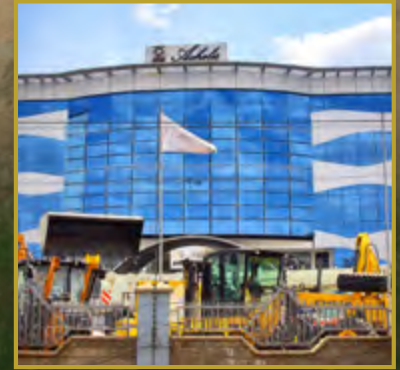
Achelis (Kenya) Limited

Beside our Technical and Industrial Division we are offering equipment and services in other key areas like Medical & Scientific, Water, Energy and Oil & Gas.