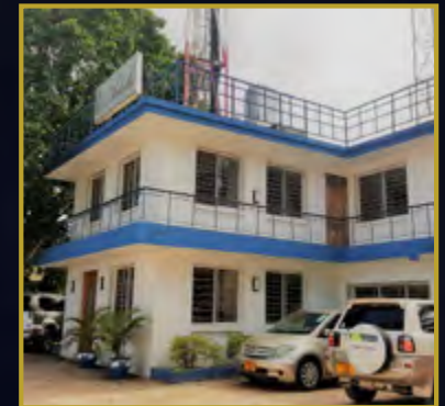
Achelis (Tanganyika) Limited