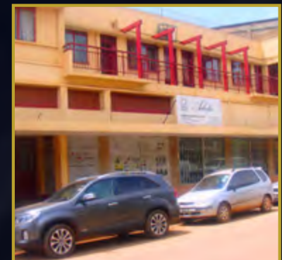
Achelis (Uganda) Limited